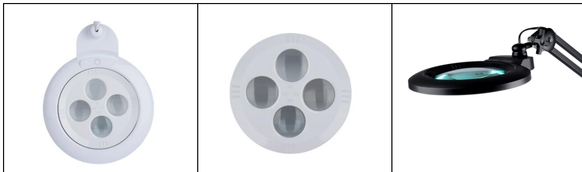
Multi diopter, one lens together 2D 8D 10D 15D